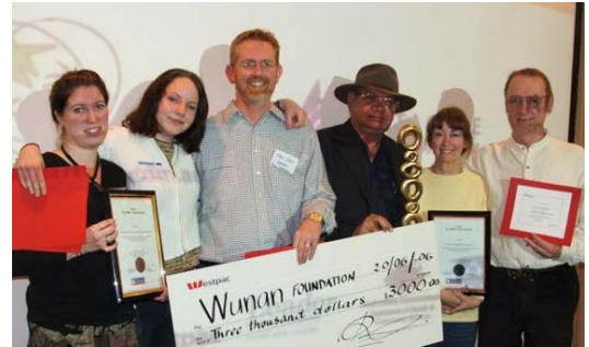
The Westpac Australian Community Idol finalists