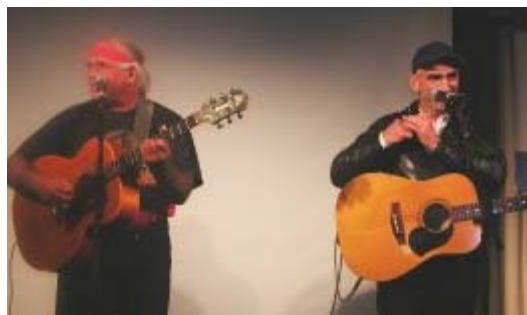
Kev Carmody and Paul Kelly conclude Communities in Control 2007 with their stirring advocacy anthem, 'From Little Things Big Things Grow'

DVDs of the conference are also available for sale by visiting www.ourcommunity.com.au/cicdvd or by contacting Alan Matic on (03) 9320 6800 or at alanm@ourcommunity.com.au .