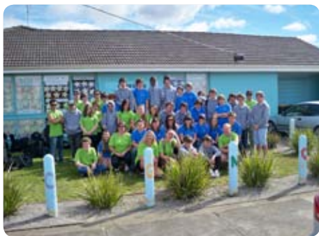
The Drop in Youth Program is an initiative of Ocean Grove Neighbourhood Centre

Drop In is a project run by the Ocean Grove Neighbourhood Centre. It gives young people on the Bellarine Peninsula a place to go where they can be themselves and also be supported by qualified youth workers.