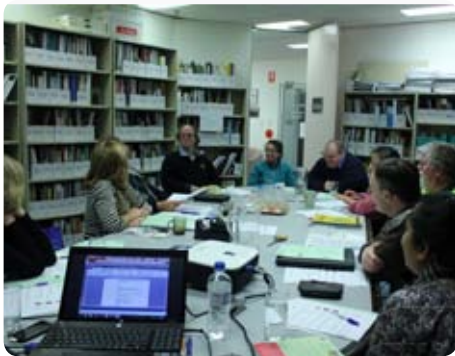
A NSW Council for Intellectual Disability board meeting