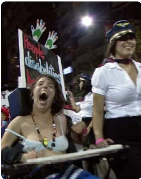
Touching Base supporters marching in the Sydney Mardi Gras 2010